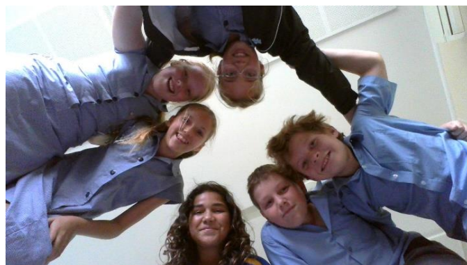
A worm's eye view

Technology can be quite tedious at times; however, everyone is enjoying finding little tricks and experimenting with different techniques.