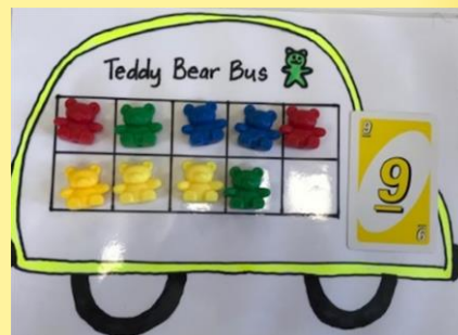
9 teddy bears on a bus